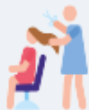
Hairdressing salons and personal grooming establishments