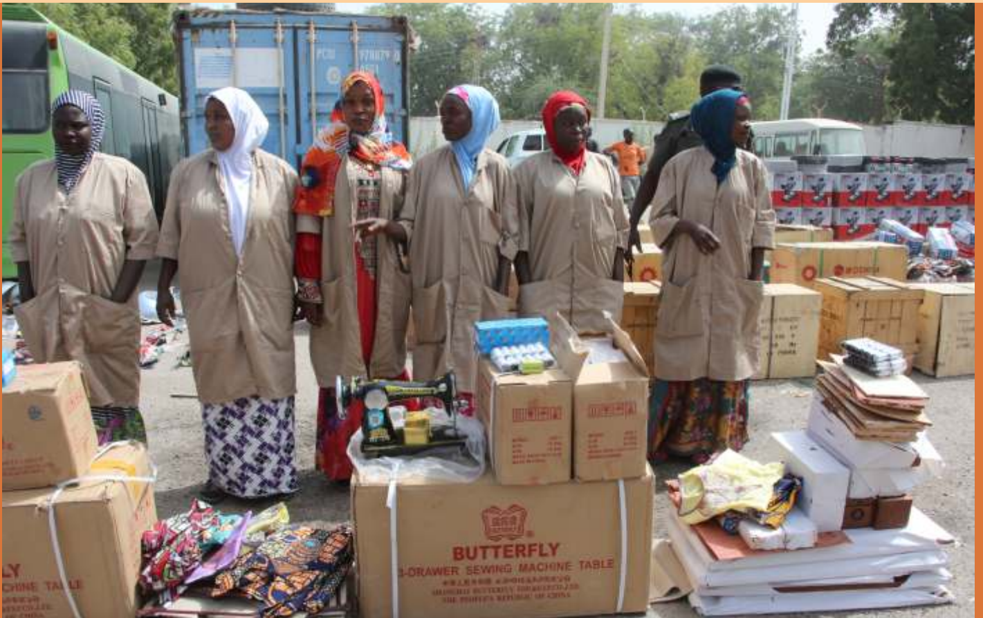
Skill Acquisition Materials