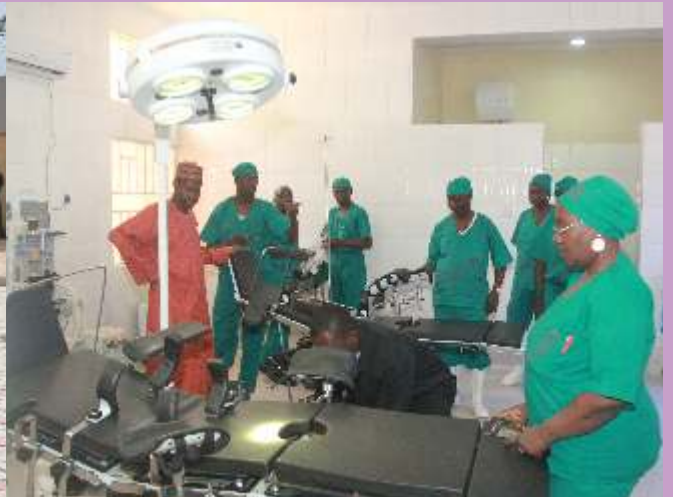
Mohammad Shuwa Hospital