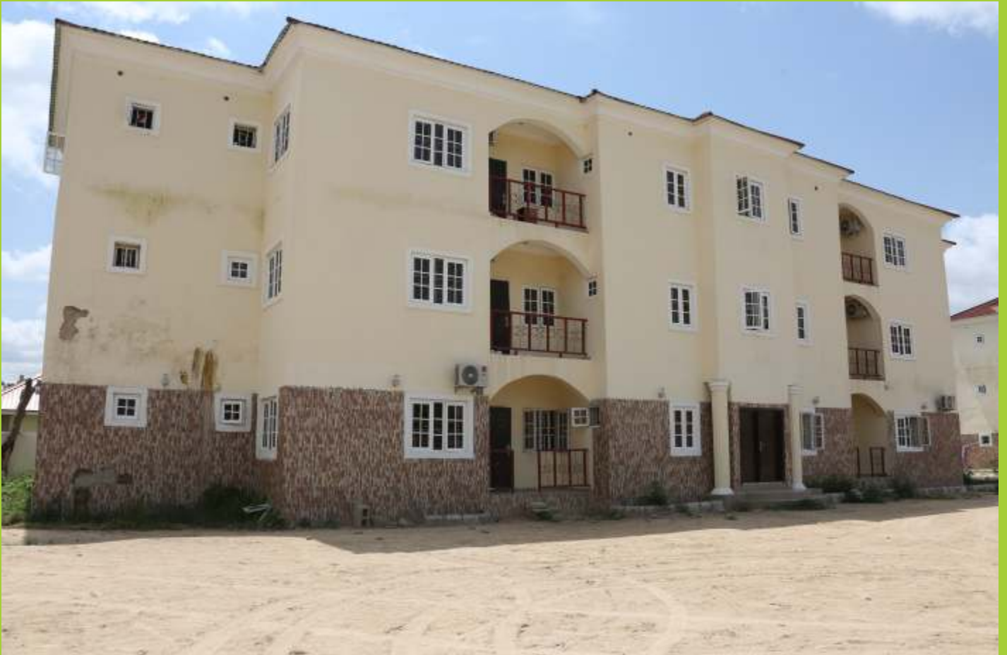
Central Bank Quarters, purchased and renovated for School of Orphans and Vulnerable Children