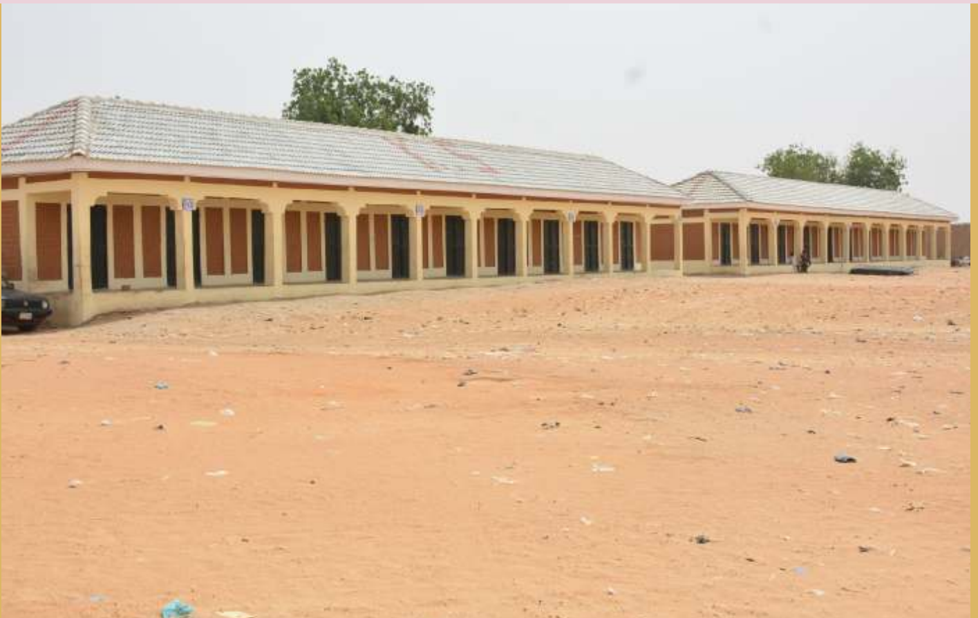
New Shops Built at Weekly Market in Ngamdu Kaga LGA