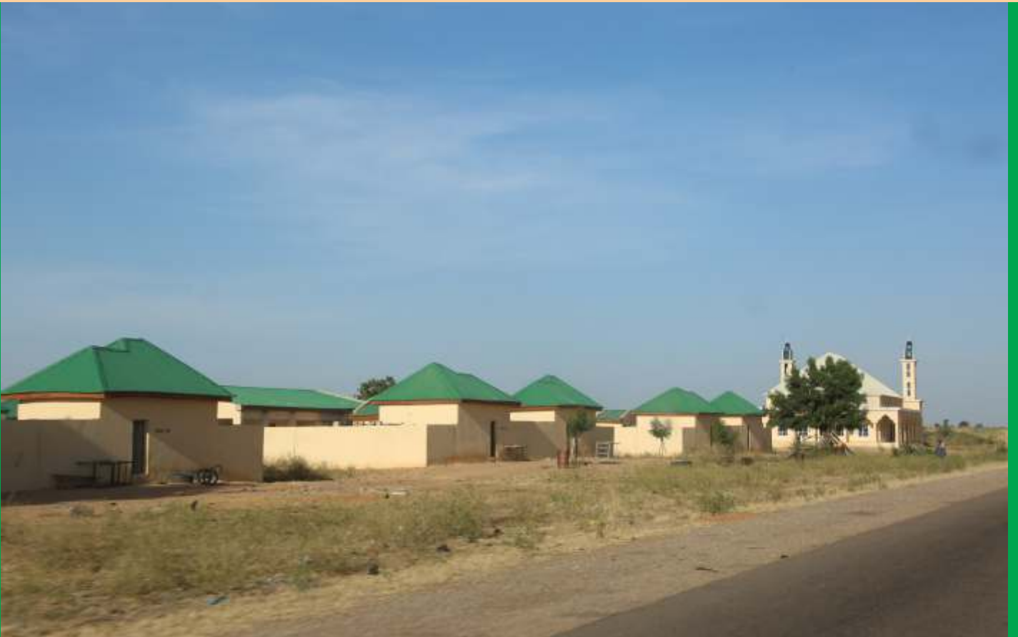
Reconstruction of Housing in LGAs