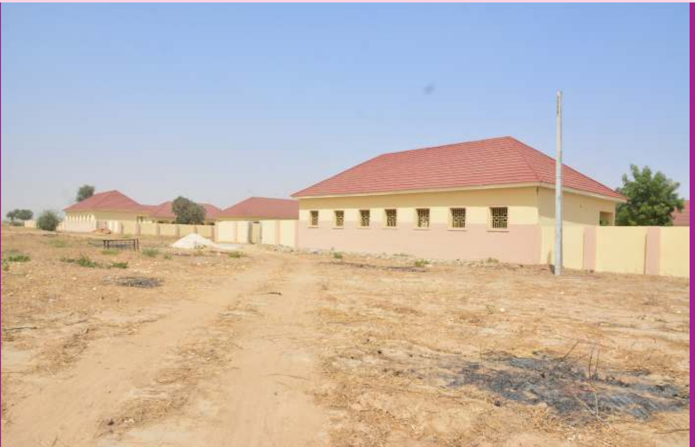
Command Secondary School Bemisheik