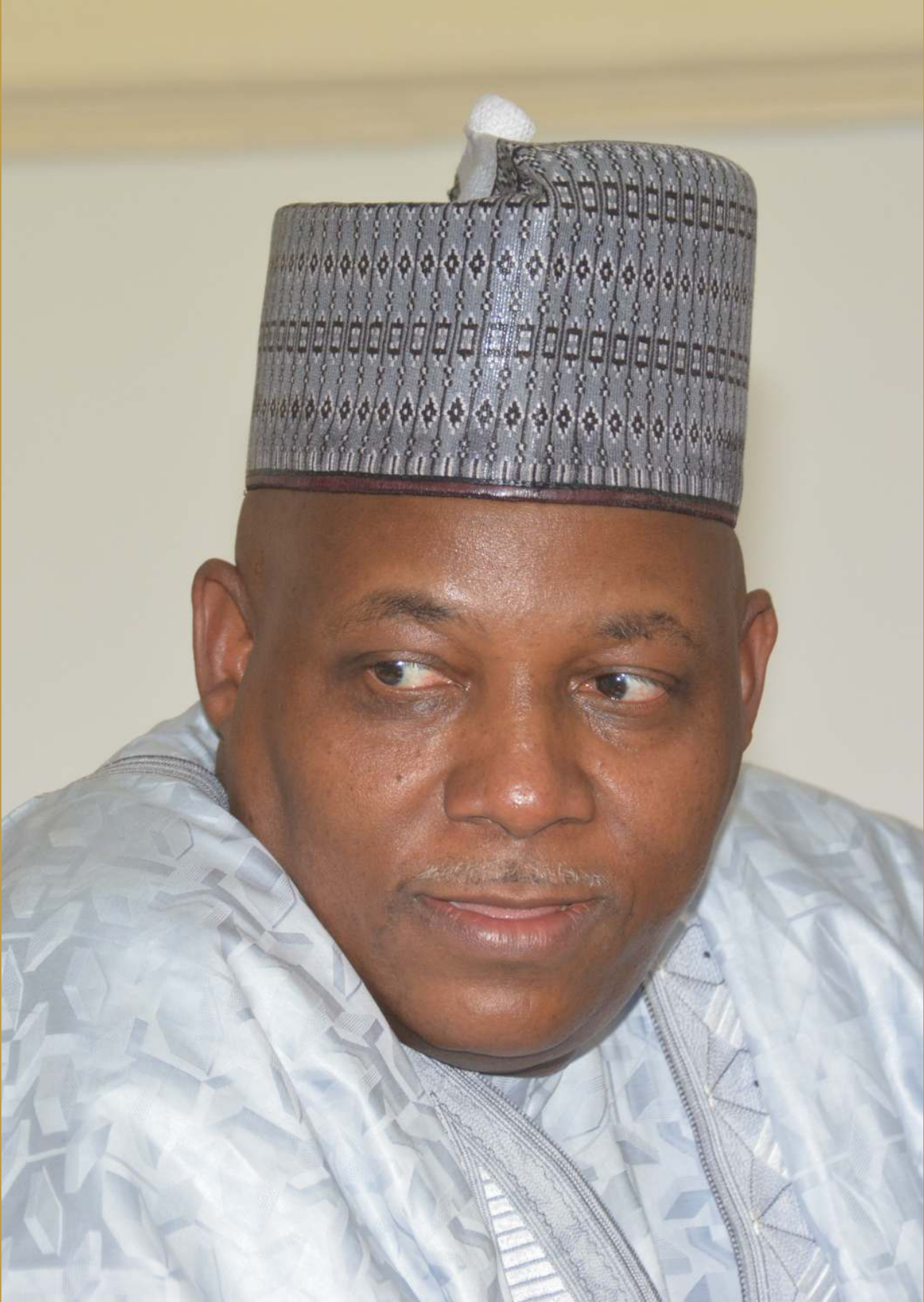
His Excellency, Honourable Kashim Shettima Executive Governor of Borno State