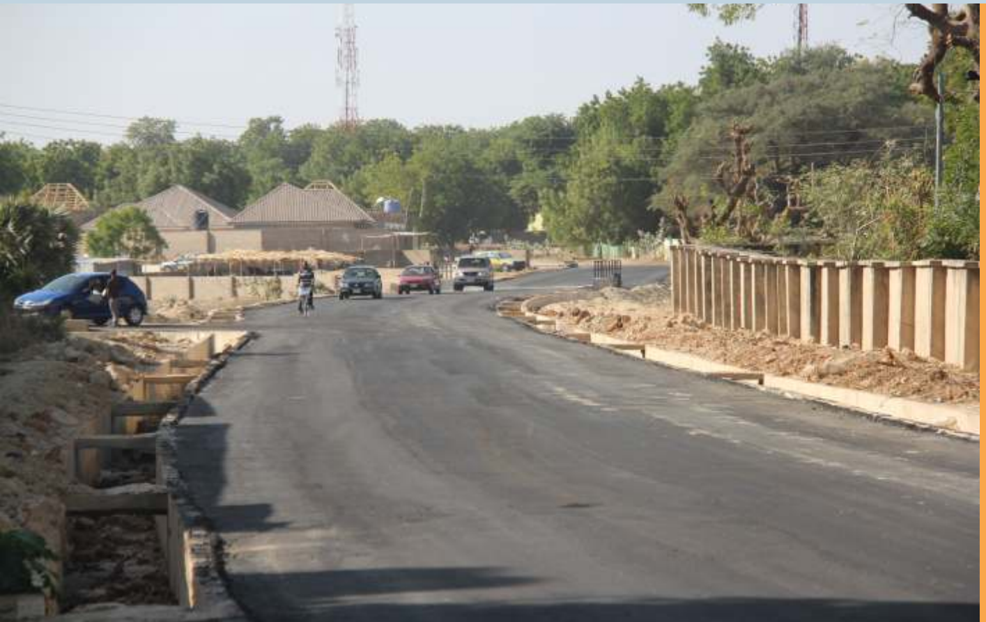
Damboa and Maduganari Link Road