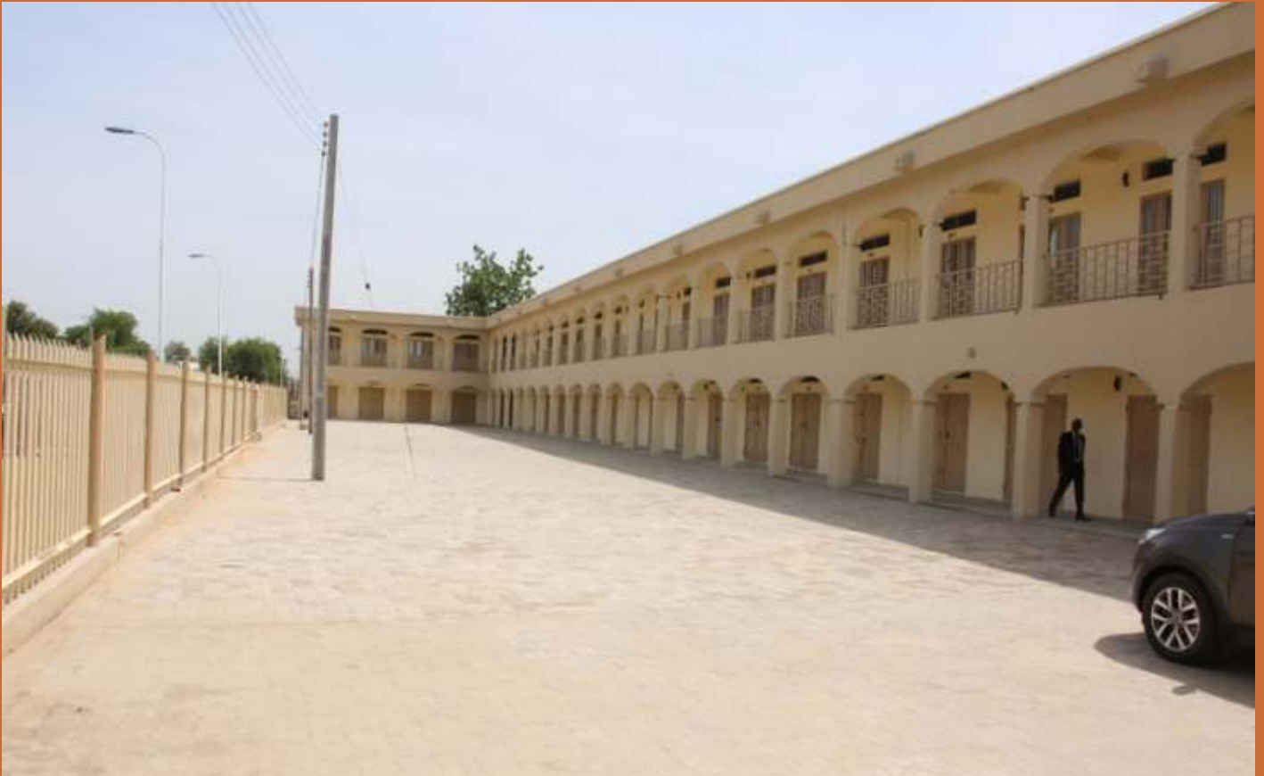
Mafoni Tailoring Centre