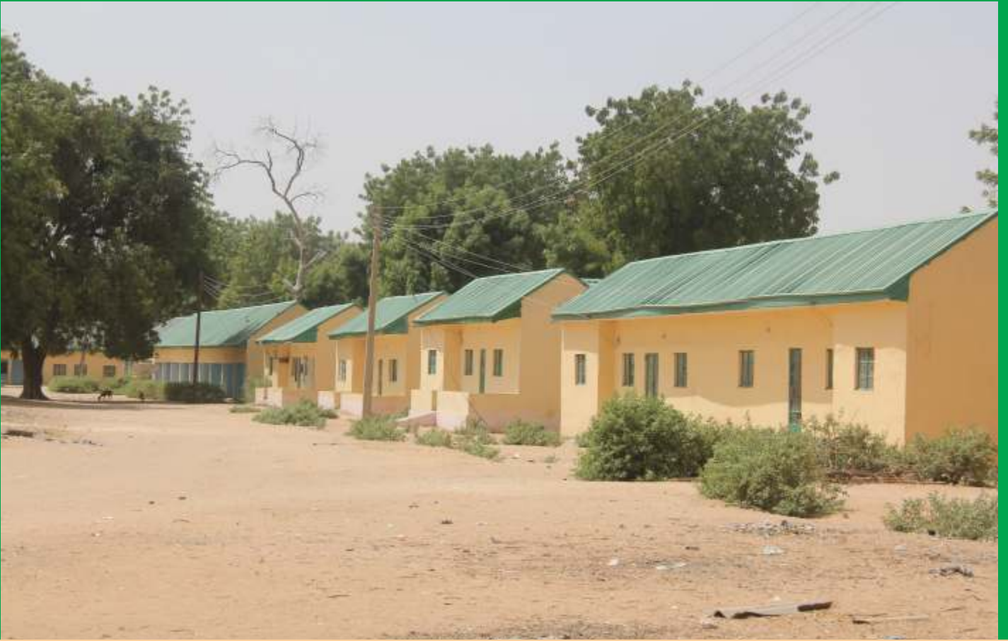
Kaga Reconstruction Projects