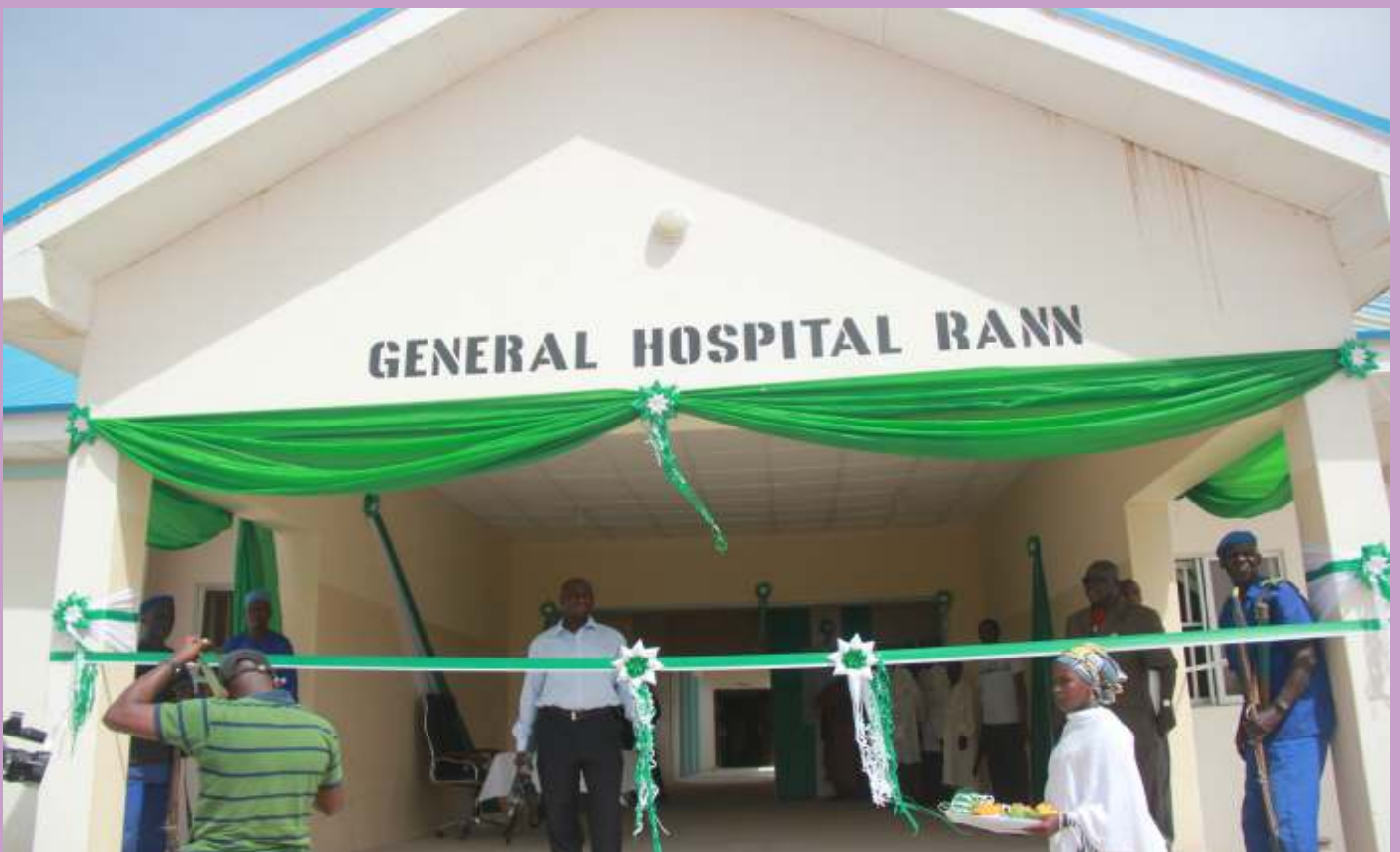
General Hospital Rann