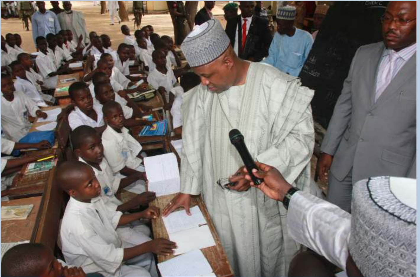
His Excellency the Governor in Class with Students at Government College