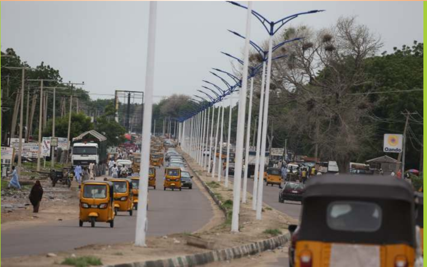
Installation of Street Light