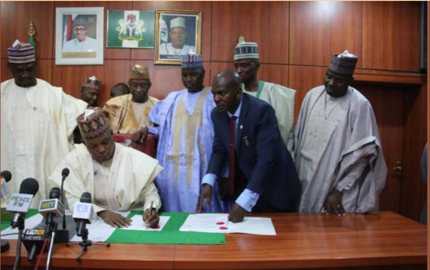
His Excellency the Executive Governor signing the 2018 Appropriate Bill