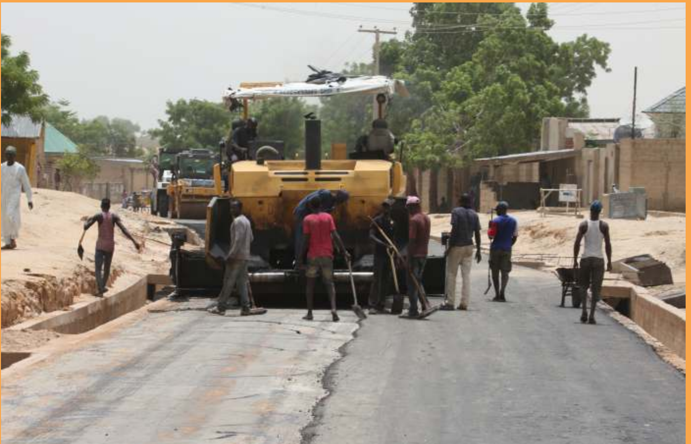
Road Project under Construction