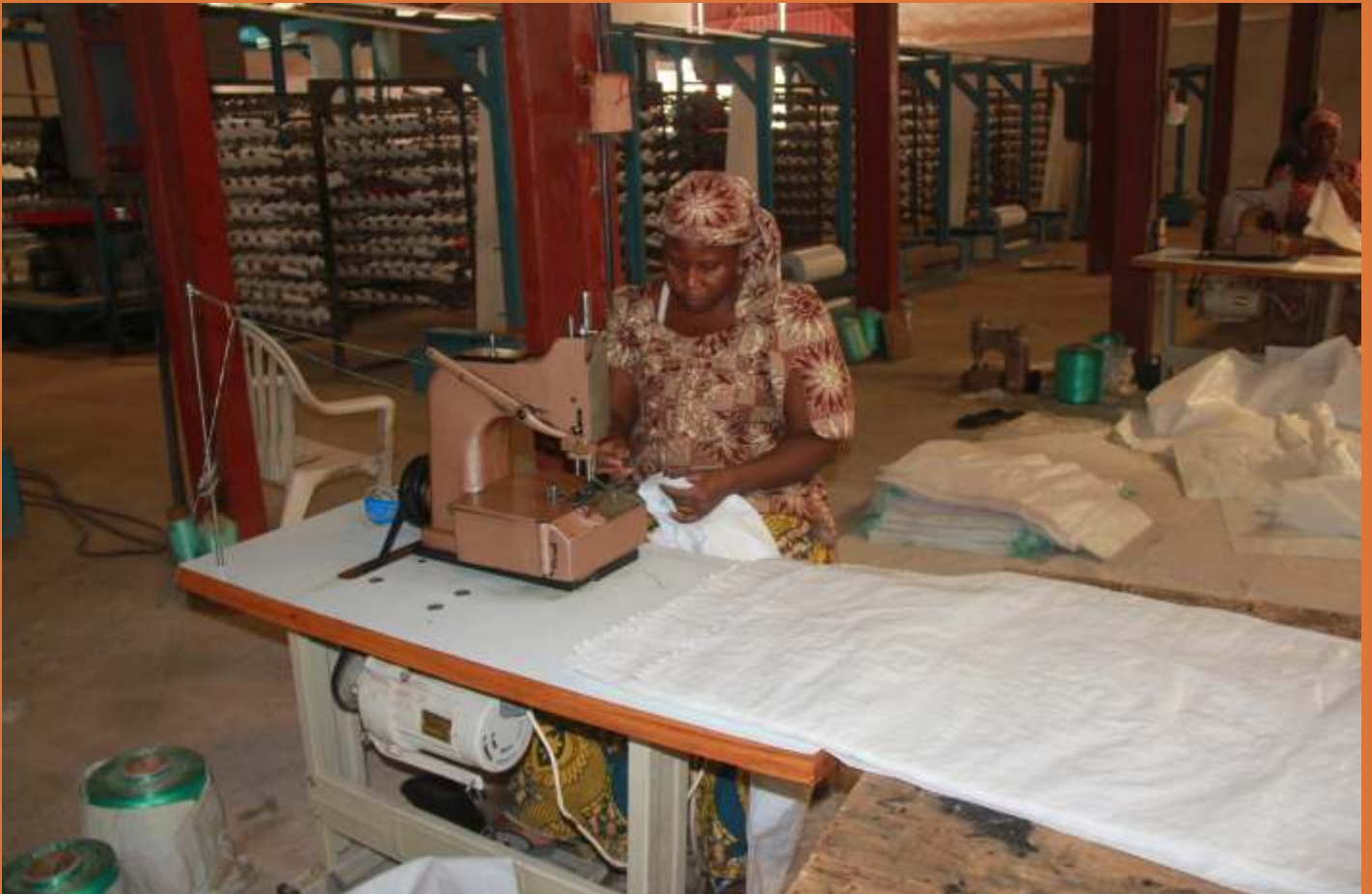
Skill Acquisition Centre