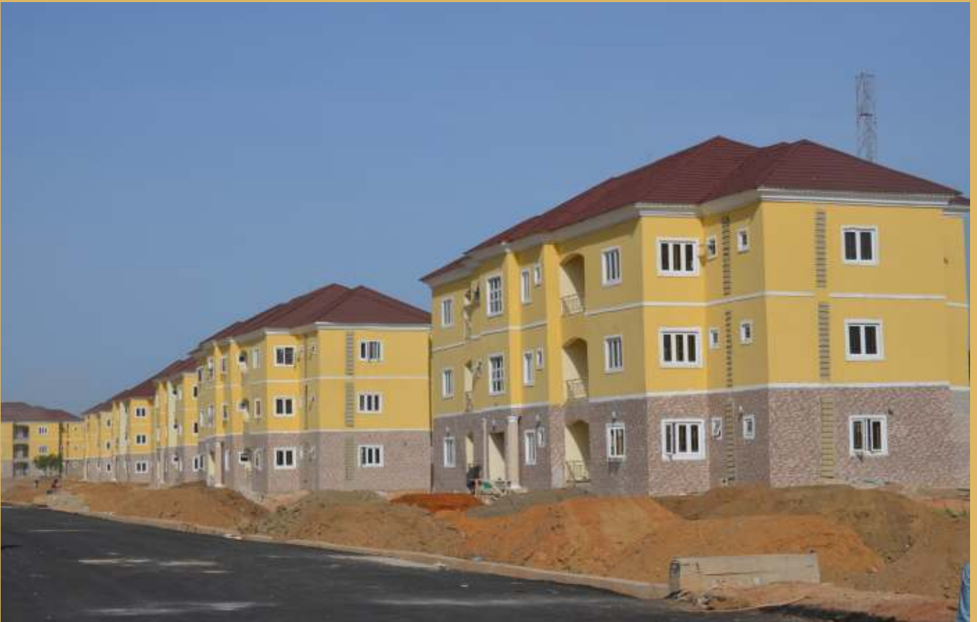
The Legacy Garden in Maiduguri