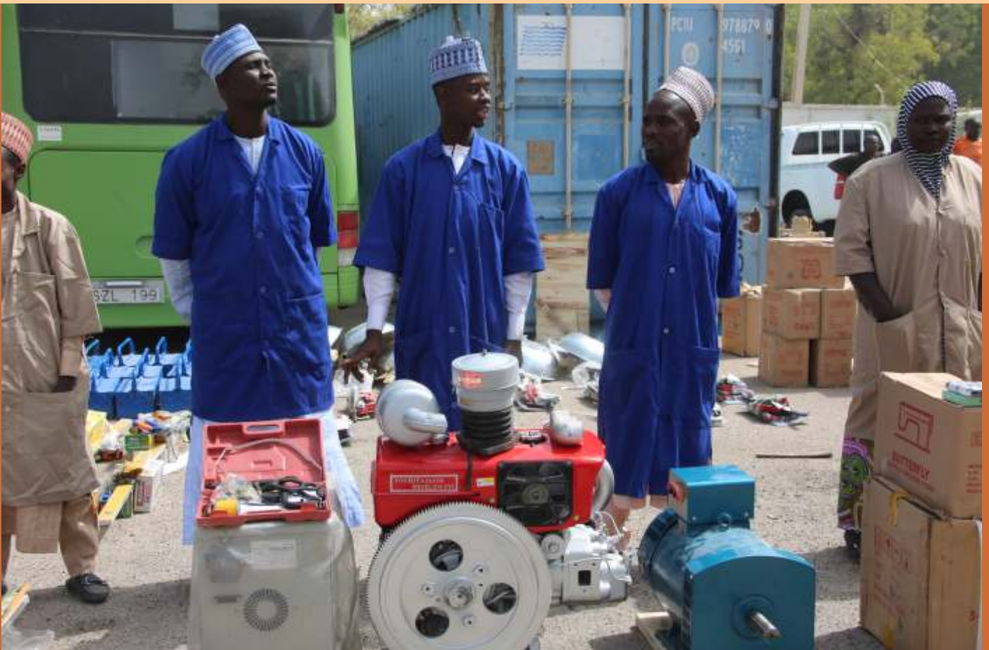
Poverty Alleviation Materials