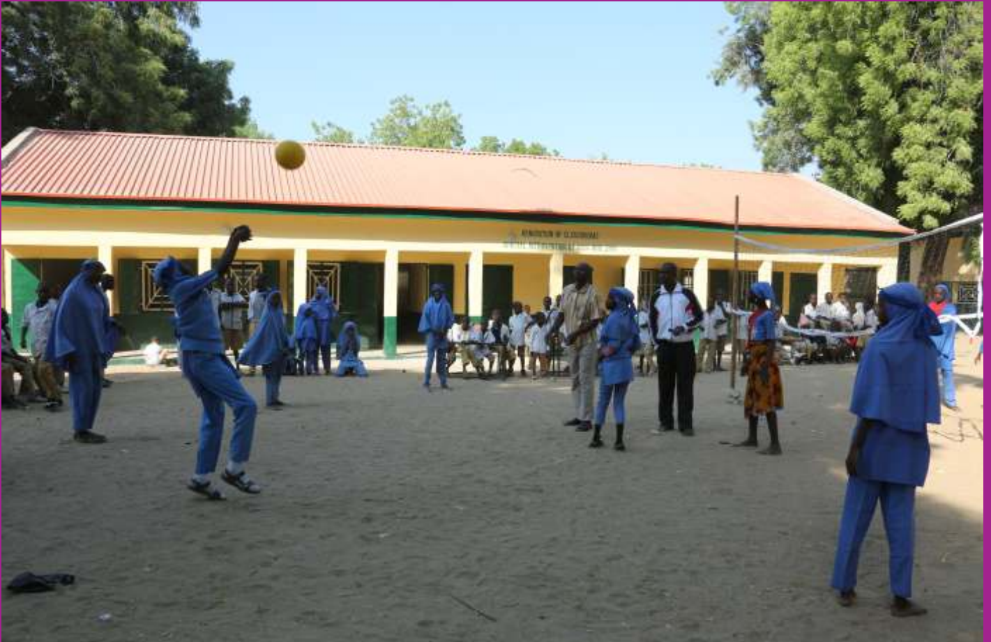
Kirikasama Primary School