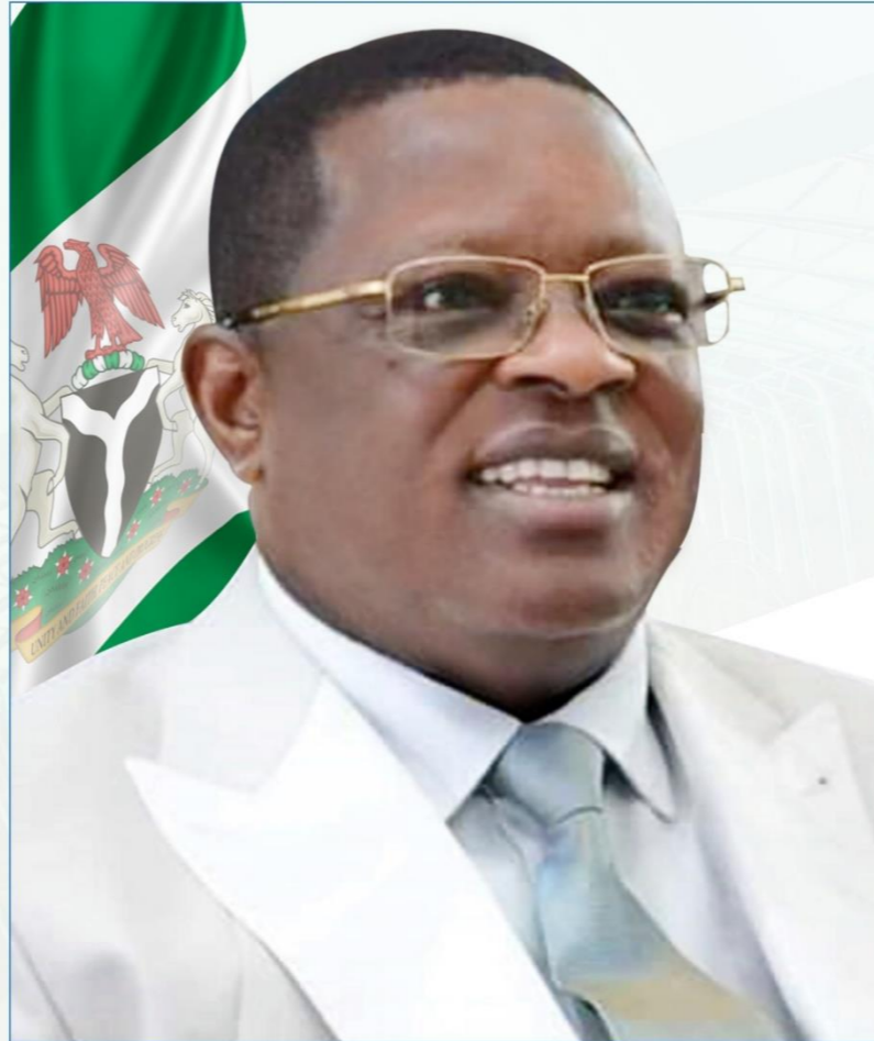
His Excellency Engr. Chief David Nweze Umahi FNSE FNATE EXECUTIVE GOVERNOR OF EBONYI STATE