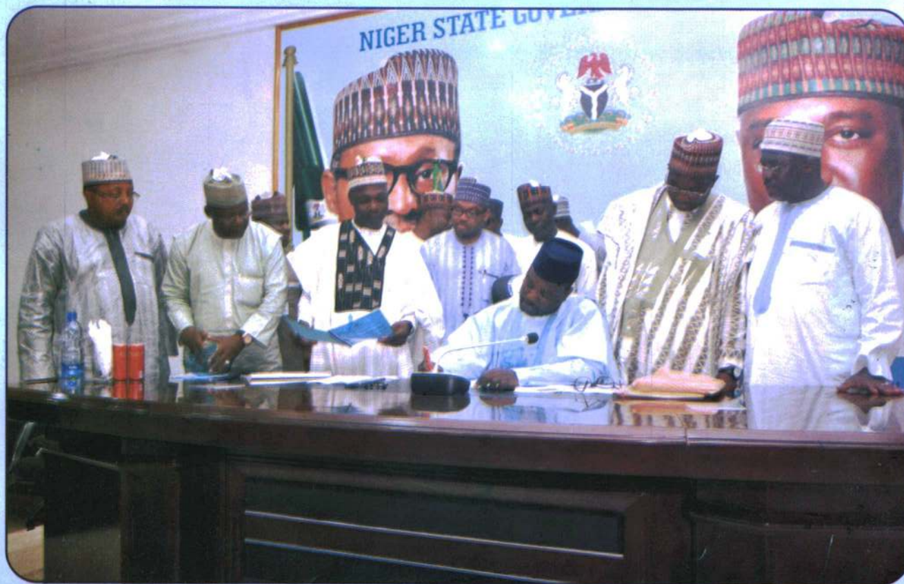
The Governor, Alhaji Abubakar Sani Bello Signing the 2017 Appropriation Bill into Law