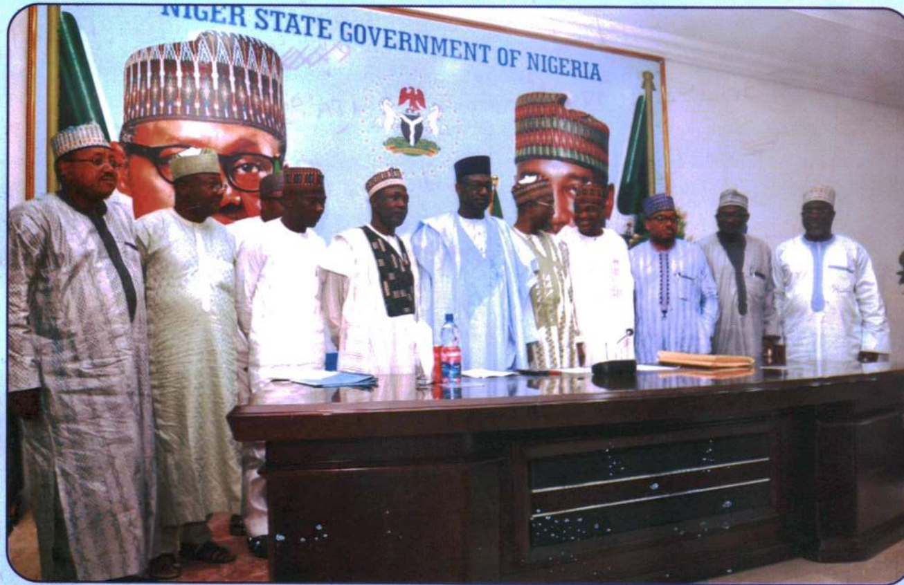
Group photograph with the Governor after 2017 Proposed Budget Presentation to the State House of Assembly