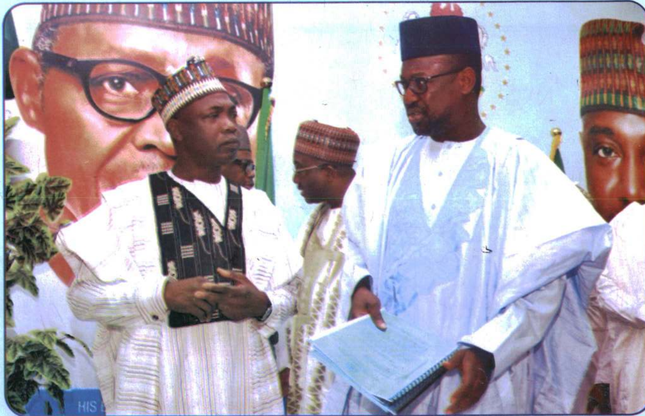
The Governor, Alhaji Abubakar Sani Bello Discussing 2017 Budget Implementation Strategy with the Speaker, Niger State House of Assembly