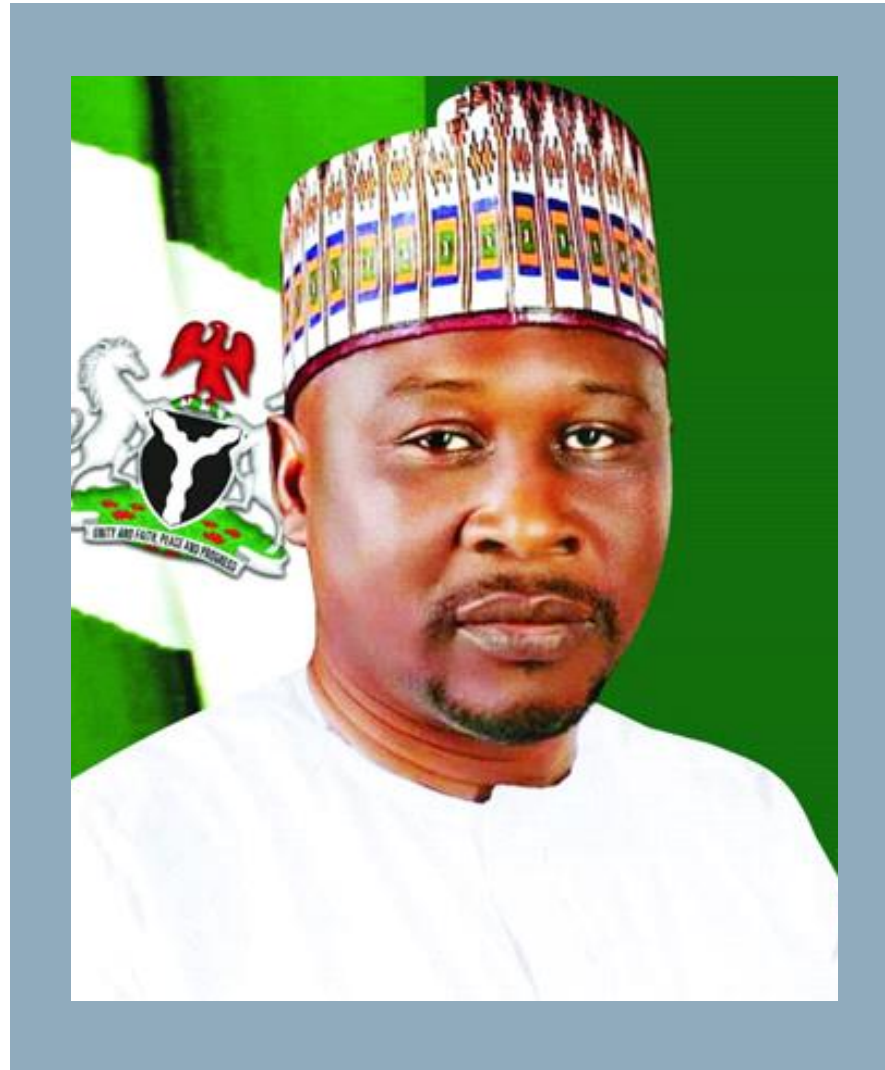
HIS EXCELLENCY AHMADU UMARU FINTIRI EXECUTIVE GOVERNOR, ADAMAWA STATE