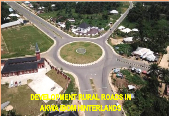
DEVELOPMENT RURAL ROADS IN AKWA IBOM HINTERLANDS