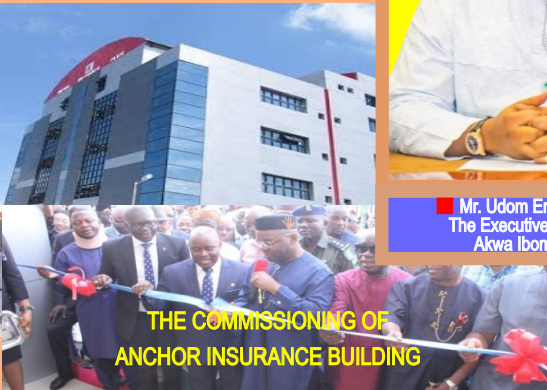
THE COMMISSIONING OF ANCHOR INSURANCE BUILDING