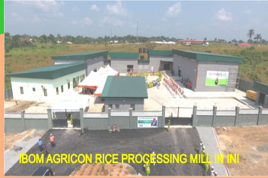
IBOM AGRICON RICE PROCESSING MILL IN INI