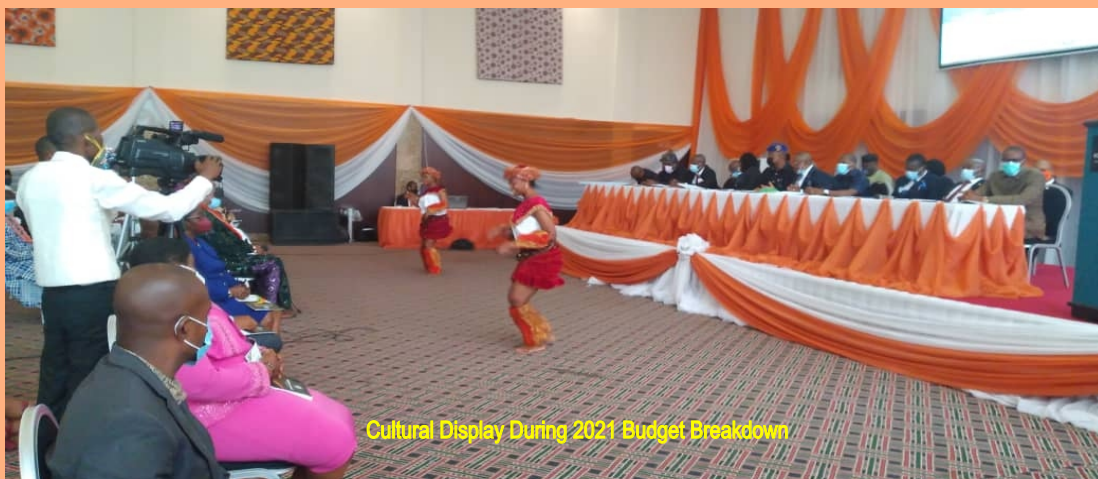
Cultural Display During 2021 Budget Breakdown