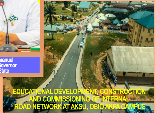
EDUCATIONAL DEVELOPMENT, CONSTRUCTION AND COMMISSIONING OF INTERNAL ROAD NETWORK AT AKSU, OBIO AKPA CAMPUS