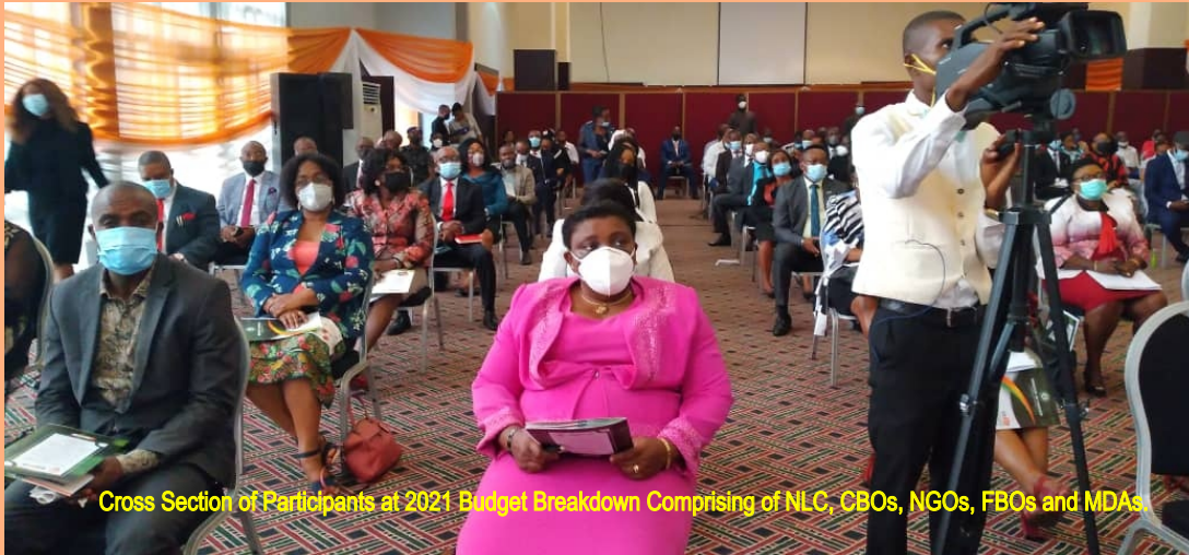
Cross Section of Participants at 2021 Budget Breakdown Comprising of NLC, CBOs, NGOs, FBOs and MDAs.