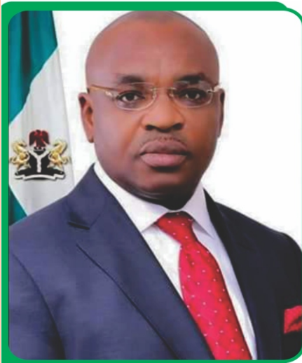
■ Mr. Udom Emmanuel The Executive Governor Akwa Ibom State

Fellow Akwa Ibom Citizens, when I presented your 2021 Budget for legitimization in the State's House of Assembly on 20th October, 2020, I did so with mix feelings: (1) I was saddened by the increasing global uncertainties which tend to reduce the available funds for the implementation of government budget and (2) As a people, our travail in the fight against the vicious pandemic did not come to naught as we still remain one of the states with least infections in Nigeria. I return all glory to God. Let me also use this opportunity to once again console with