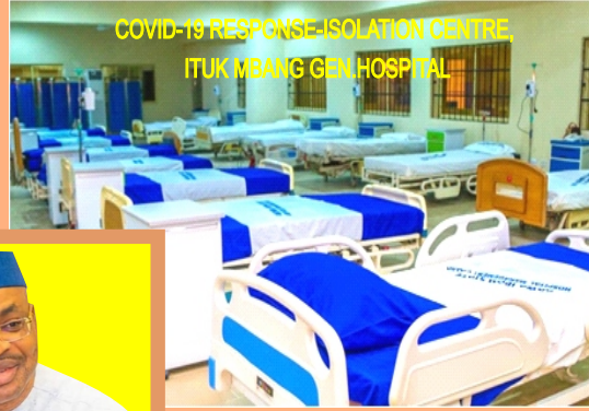
COVID-19 RESPONSE-ISOLATION CENTRE ITUK MBANG GEN. HOSPITAL