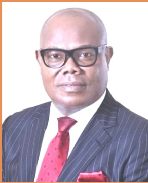
■ Mr. Akan Okon Hon. Commissioner Min. Econ. Dev. & IDSP

The 2021 Budget is predicated on an oil benchmark of $40 per barrel, at a production rate of 1.86 million barrels per day (bpd), with an estimated exchange rate of N379/US$, in line with the National Budget projections.