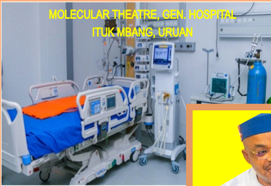
MOLECULAR THEATRE, GEN. HOSPITAL ITUK MBANG, URUAN