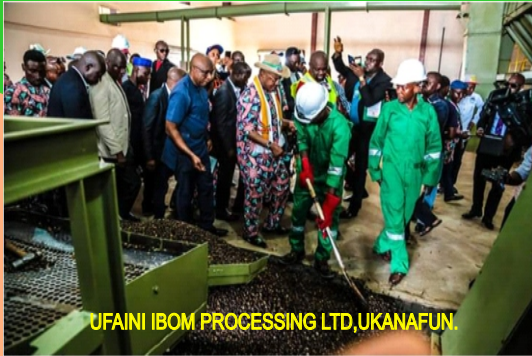
UFAINI IBOM PROCESSING LTD, UKANAFUN.