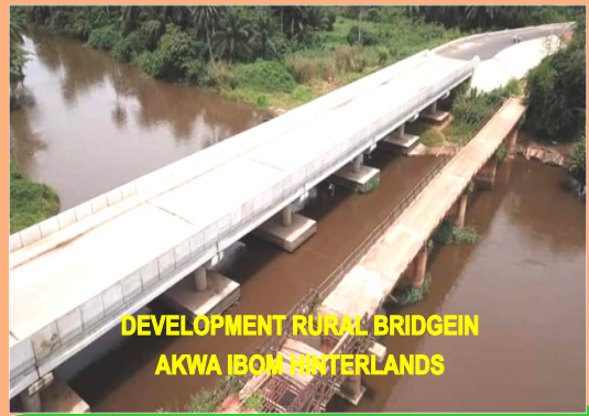
DEVELOPMENT RURAL BRIDGE IN AKWA IBOM HINTERLANDS