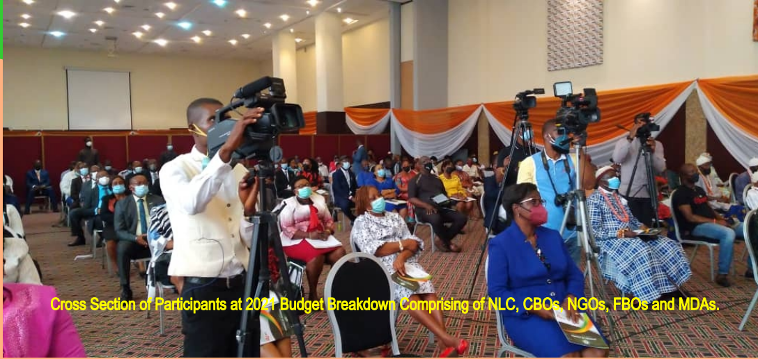
Cross Section of Participants at 2021 Budget Breakdown Comprising of NLC, CBOs, NGOs, FBOs and MDAs.