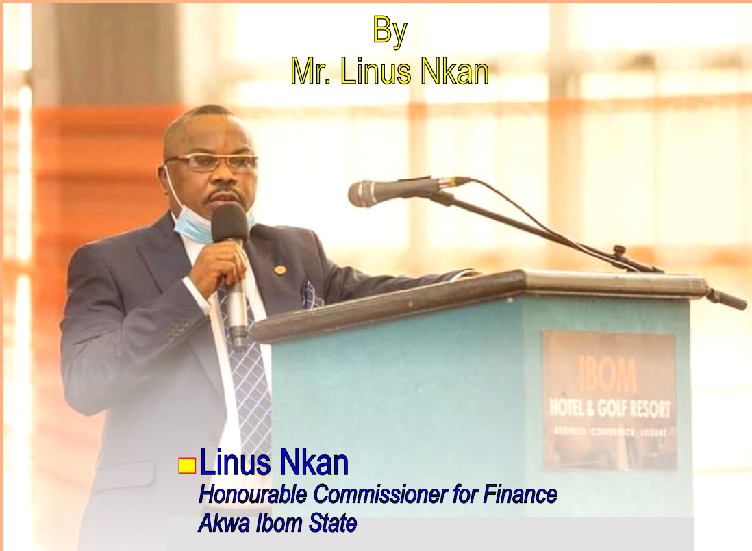
■ Linus Nkan Honourable Commissioner for Finance Akwa Ibom State