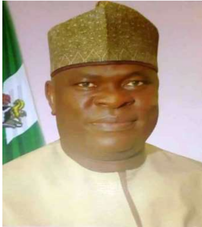
HON. DAVID OLOFU Honourable Commissioner Ministry of Finance, Benue State.