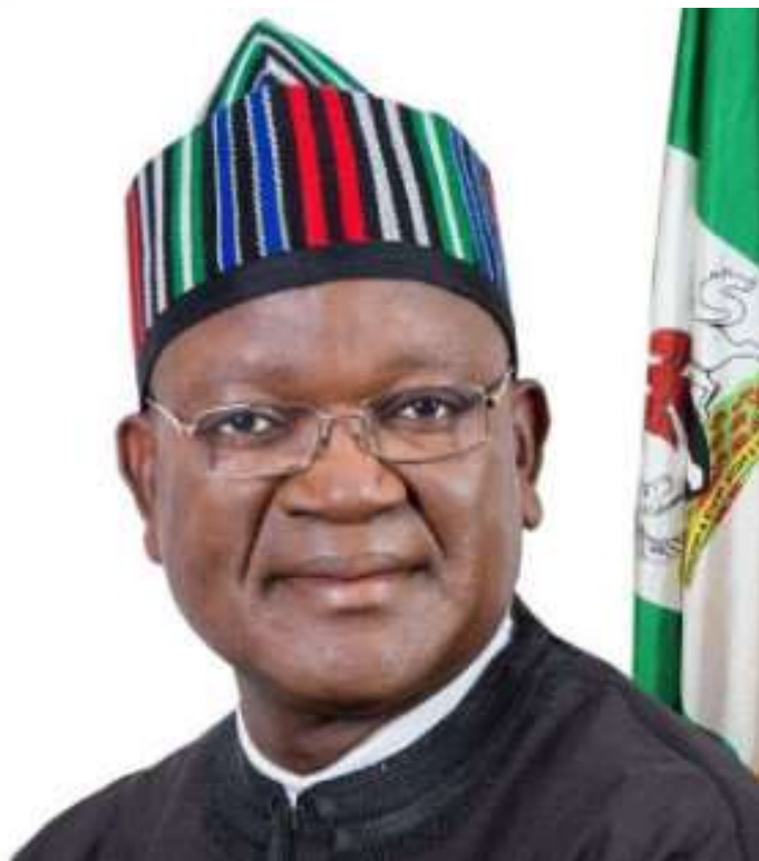
His Excellency CHIEF DR. SAMUEL ORTOM Executive Governor, Benue State.