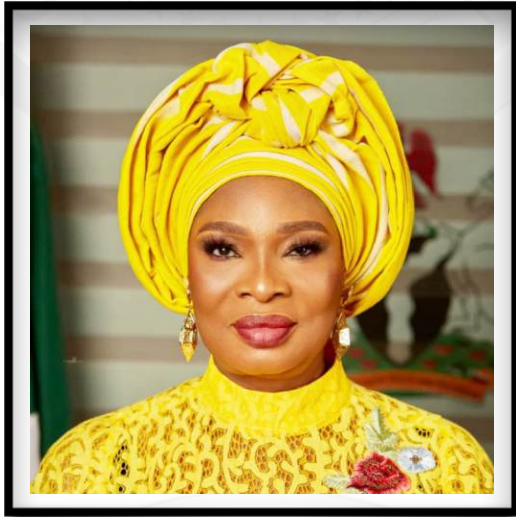
Princess Patricia Obila Deputy Governor of Ebonyi State