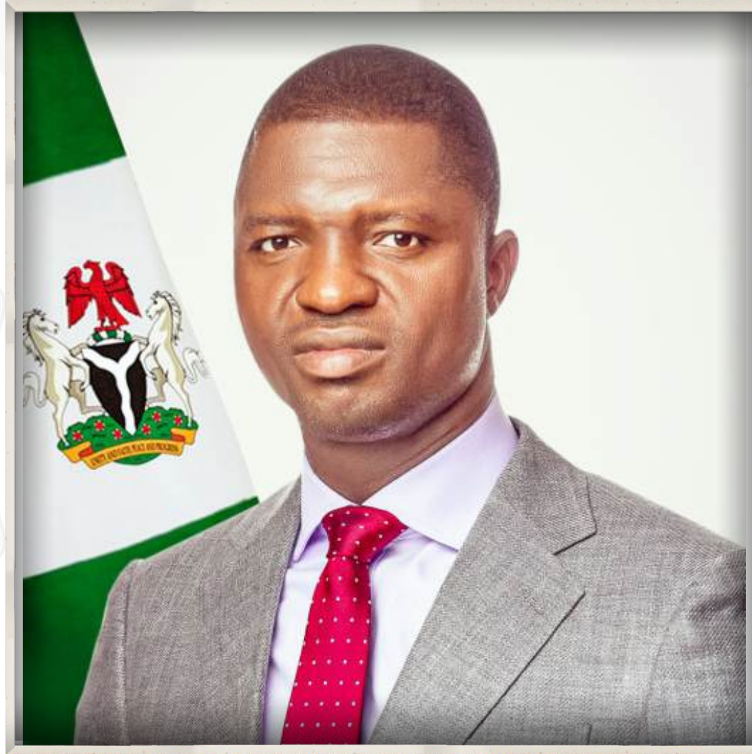
Rt. Hon. Bldr. Francis Ogbonnaya Nwifuru Executive Governor of Ebonyi State