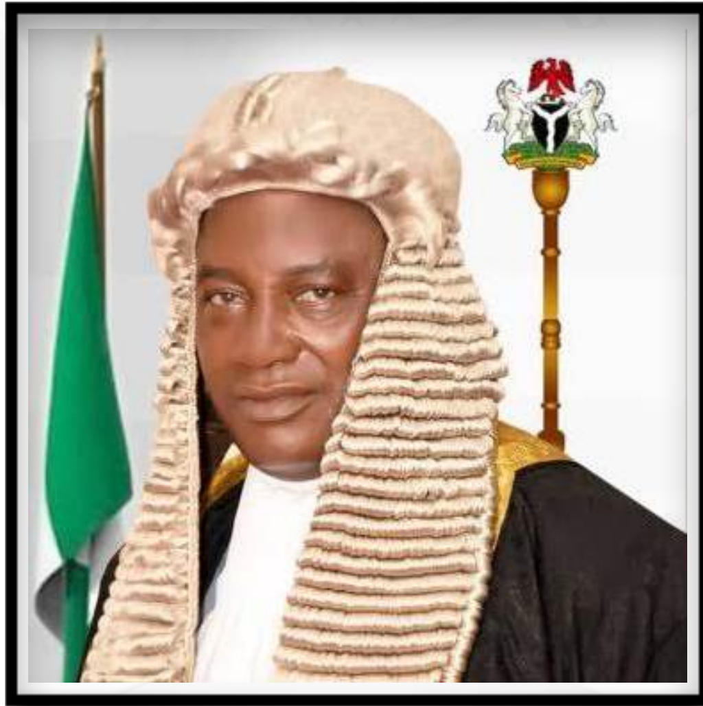
RT. HON. MOSES ODUNWA RT. HON. SPEAKER, EBONYI STATE HOUSE OF ASSEMBLY